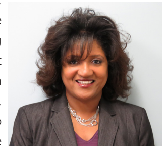
LISA RICE, KEYNOTE

We will soon be ushering in 2022. With federal leadership at the very top focused on rebuilding the country's infrastructure, including affordable housing, things are looking up. The importance of affordable housing is not in doubt. The spike in market rate housing prices in rental and in homeownership housing is acute, and the consequence of failing to produce and preserve affordable housing is homelessness. The