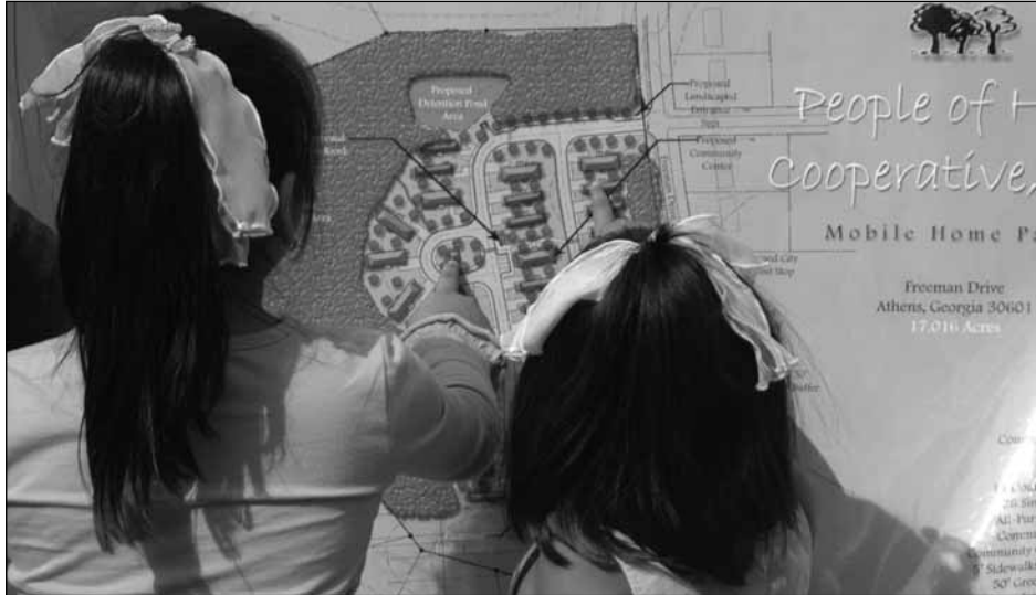
Future young residents of the People of Hope Park review the plat design of their park.