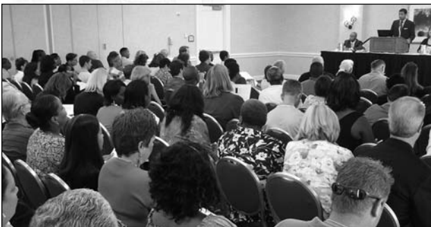
Workshop sessions were filled to capacity.