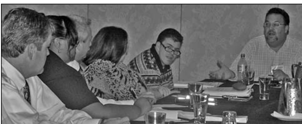
The Developmental Disabilities Council Stakeholders Meeting covered issues such as housing needs for people with developmental disabilities like spina bifida, autism, cerebral palsy, and mental retardation.