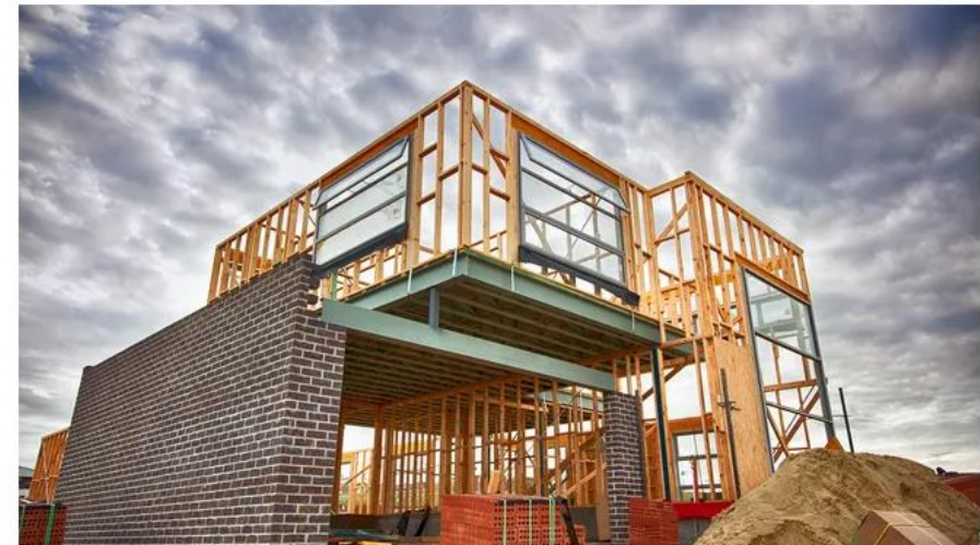
A house under construction.

Florida's population continues to grow. According to a recent report by the Demographic Estimating Conference, Florida will be home to more than 300,000 additional residents per year, every year, for the next five years.