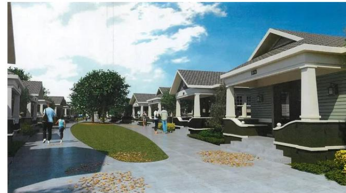
A rendering of a micro cottage development in Lakeland, which was included in the agenda for Cape Coral's Affordable Housing Advisory Committee meeting recently.