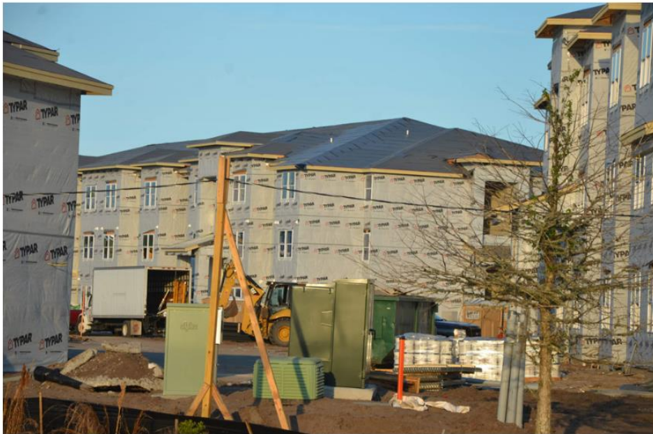
Affordability is essential to the workforce.

Recommend 60 people recommend this. Be the first of your friends.