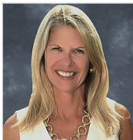
SEN. DEBBIE MAYFIELD FLORIDA SENATE