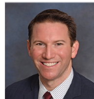
REP. DAVID SILVERS Florida House of Representatives