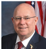
REP. SAM KILLEBREW Florida House of Representatives